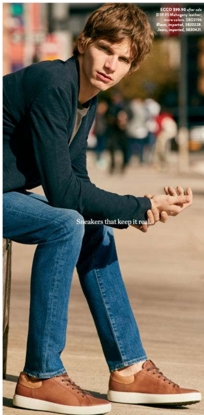
ECCO $99.90 after sale $159.95 Mahogany leather; more colors. 5803196 Blazer, imported. 5820228. Jeans, imported. 5830421.