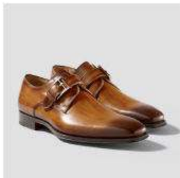
MAGNANNI $233.90 after sale $350 Cuero brown leather; more colors. Also in wide sizes. 387453