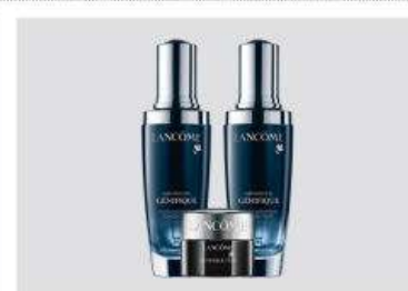
LANCÔME Youth Activating Trio $156 ($236.50 value) 5839097