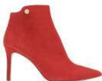
LOUISE ET CIE $99.90 after sale $149.95 Red suede; more colors. 5821822