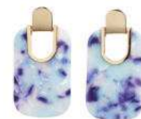
KATE SPADE NEW YORK $37.90 after sale $58 Lilac/multi; more colors. 5844104