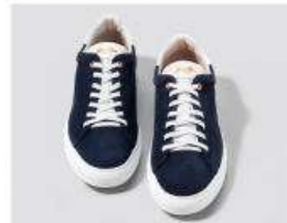
GOOD MAN BRAND $131.90 after sale $198 Navy/white calf suede; more colors. 5758286