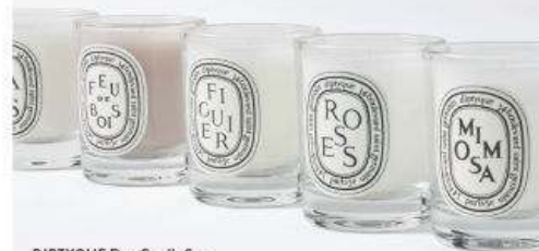
DIPTYQUE Five-Candle Set Smoky, romantic and more—it's a mood. $55 ($75 value) Baies, Feu de Bois, Figuier, Roses and Mimosa. 1.2 oz. each. 5838052

We've got hundreds of ways to elevate your day: Minis, sets and can't-miss items you'll only find at Nordstrom—in stores and online. Start with five of our favorites.