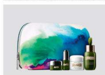
LA MER The Soothing Collection $360 ($475 value) 5839978