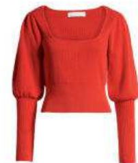
ASTR THE LABEL $49.90 after sale $75 Bright red; more colors. Imported. 5836729 Savvy.