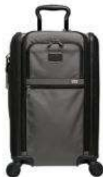
TUMI $501.90 after sale $750 Carry-on. Castle grey/black. 5838587