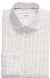
ETON $186.90 after sale $280 White (red and blue micro print). Imported. 5839875