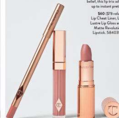
CHARLOTTE TILBURY The Pillow Talk Lip Kit Flattering beyond belief, this lip trio adds up to instant pretty. $60 ($78 value) Lip Cheat Liner, Lip Lustre Lip Gloss and Matte Revolution Lipstick. 5840310

Our Beauty Stylists are experts across all brands, and consultations are fun—and free! Schedule your appointment in store or call 1.800.7beauty.