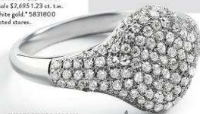
5. BONY LEVY Diamond Ring, exclusive $2,770.90 after sale $3,695 1.23 ct. t.w. 18k white gold.* 5831800 *Selected stores.

HOW TO MAKE A CLASSIC SIGNET EVEN BETTER: PAVE DIAMONDS.