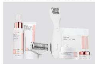
BEAUTYBIO Giopro Head to Toe Set $179 after sale $304 ($360 value) 5832722