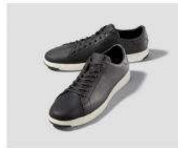
COLE HAAN $89.90 after sale $150 Black oil leather; more colors. Also in wide sizes. 5172234