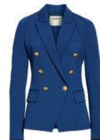
L'AGENCE $394.90 after sale $595 Deep ocean. Imported. 5825604 via C.