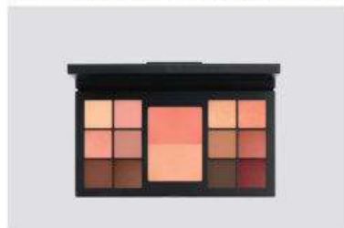
MAC Warm Eye & Face Kit $42 ($82 value) 5834341