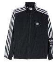
ADIDAS ORIGINALS Track Jacket $59.90 after sale $80 Black. 5778014