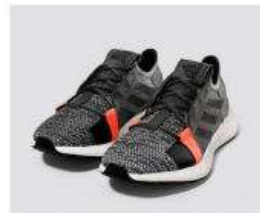
ADIDAS $89.90 after sale $119.95 Grey/ core black/solar red; more colors. 5770636