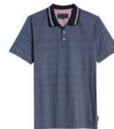
TED BAKER LONDON $74.90 after sale $115 Navy; more colors. Imported. 5825066