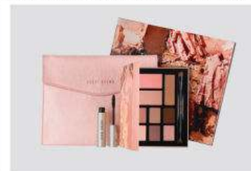
BOBBI BROWN The Essential® Deluxe Eyeshadow & Face Palette $85 ($265 value) 5839717