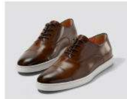
SANTONI $345.90 after sale $525 Brown leather; more colors. 5081037