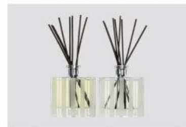
NEST FRAGRANCES Diffuser Duo: Bamboo and Grapefruit $58 ($88 value) 5596598