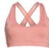
ZELLA Sunray Bra, exclusive $31.90 after sale $49 Pink rosette; more colors. Extended sizes. 5806661