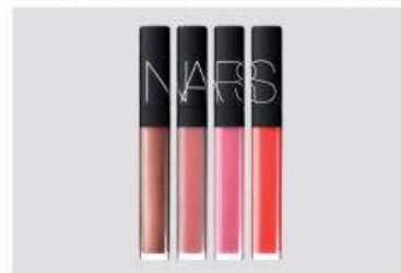
NARS Hot Tropic Lip Gloss Set $39 ($96 value) 5831160