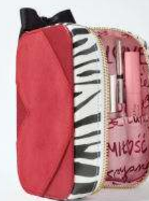
TRISH MCEVOY Power of Makeup Heart Planner The classic, carries everything-you-need planner has never been cuter. $250 ($553 value) Eleven must-have essentials for face, eyes and lips. 5831360