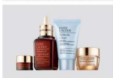
ESTÉE LAUDER Repair + Renew Set $104 ($152 value) 5836406

Mark your calendars: We're hosting two full weeks of free samples, gifts with purchase, makeovers and more. Stop in any time between Friday, July 19, and Sunday, August 4, for inspiration, education and celebration of all things beauty, including two Glam Up firsts—Self-Care Sunday on July 28 and National Lipstick Day on Monday, July 29. For details, go to nordstrom.com/glamup .