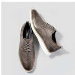
COLE HAAN $149.90 after sale $280 Pewter leather; more colors. 5371960