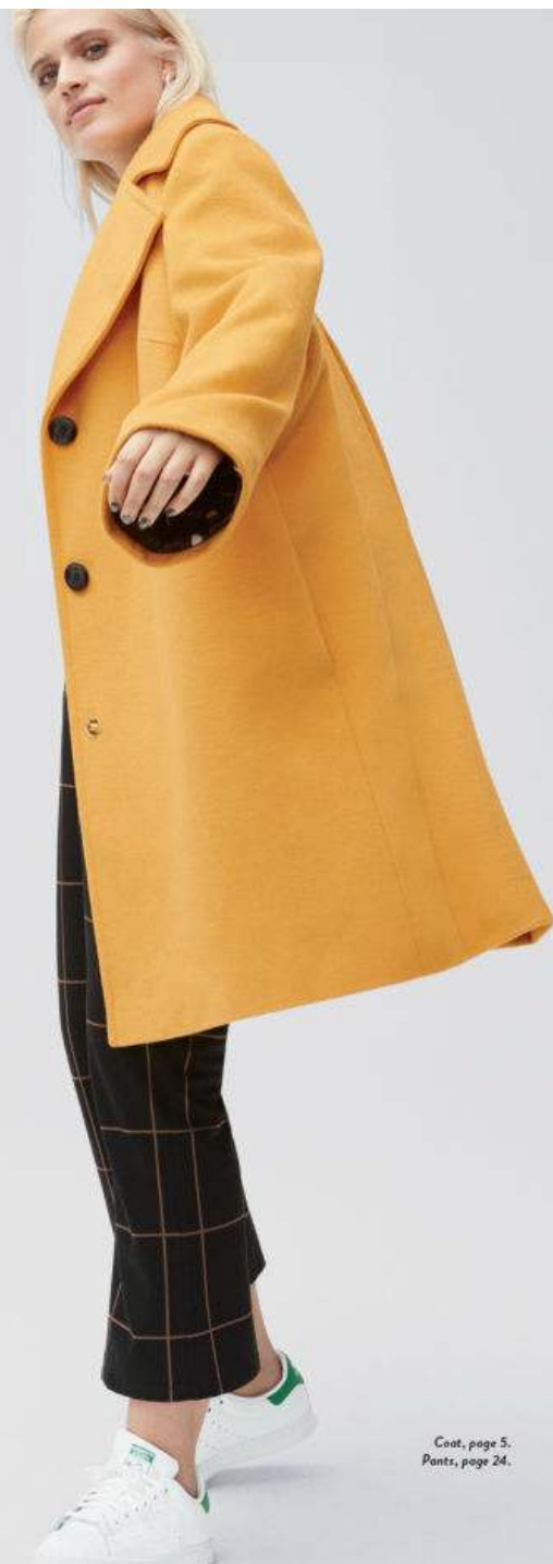
Coat, page 5. Pants, page 24.

Don't miss the best deals: Update your Nordy Club profile to stay in the loop on all things Anniversary Sale—and get special offers! Just go to nordstrom.com/myaccount .