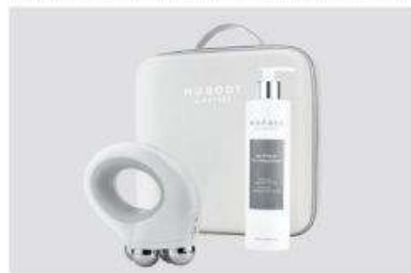
NUFACE NuBODY Skin Toning Device Set $267.33 after sale $399 5832734