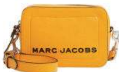
MARC JACOBS $195.90 after sale $295 Bold gold leather; more colors. 5841514