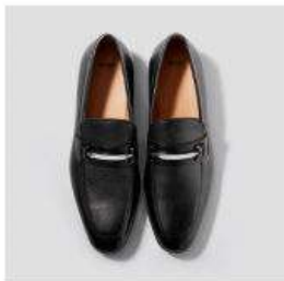
BOSS $179.90 after sale $278 Black leather; more colors. 5815303