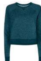
SWEATY BETTY Crop Sweatshirt $49.90 after sale $75 Deep lake; more colors. 5842568