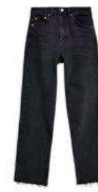
TOPSHOP Raw Split-Hem $52.90 after sale $80 Washed black. Imported. 5851253 Topshop.