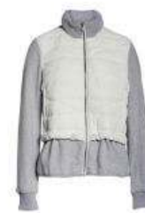
ZELLA Hybrid Jacket, exclusive $98.90 after sale $149 Grey heather; more colors. Extended sizes. 5806656