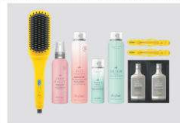
DRYBAR Get Brushin' & Crushin' Set $165 ($238 value) 5831117