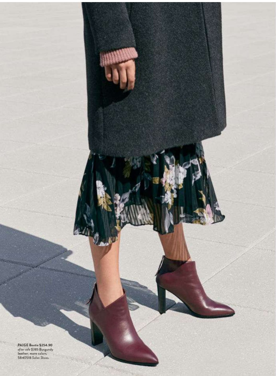
PAIGE Bootie $254.90 after sale $385 Burgundy leather; more colors. 5840518 Salon Shoes.