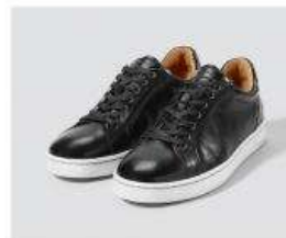
MAGNANNI $216.90 after sale $325 Black leather; more colors. 5497472