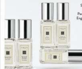
JO MALONE LONDON Fragrance Collection Mix, spritz and layer to make it your own. $92 ($115 value) Wood Sage & Sea Salt, Nectarine Blossom & Honey, Peony & Blush Suede, English Pear & Freesia and Wild Bluebell. 0.3 fl. oz. each. 5839766