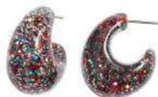
KATE SPADE NEW YORK $37.90 after sale $58 Black multi; more colors. 5837234

Color your world with shoes, accessories and clothing in optimistic shades.