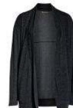
ZELLA Wrap, exclusive $45.90 after sale $69 Black; more colors. Extended sizes. 5827773