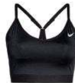
NIKE Sports Bra Prices available in stores and online. Black. Plus. 5683708