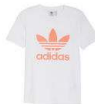
ADIDAS ORIGINALS Trefail Tee $21.90 after sale $30 White/flash red. 5506923