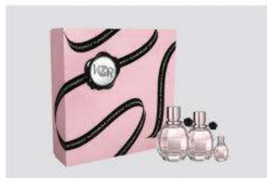
VIKTOR&ROLF Flowerbomb® Eau de Parfum Set $140 ($228 value) 5839132