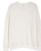
ALO Pullover $51.90 after sale $78 Pristine heather; more colors. 5478003