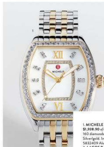
1. MICHELE Relové Watch $1,938.90 after sale $2,895 160 diamonds (0.63 ct. t.w.). Silver/gold. Includes bracelet. 5832409 Also in silver.

Get inspired at nordstrom.com/anniversarystyleup .