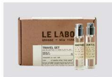
LE LABO Fragrance Duo: AnOther 13 and Santal 33 $98 5748762