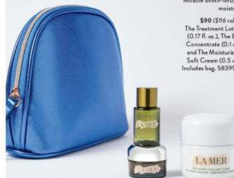
LA MER Mini Miracles Collection Indulge in luxury skin care with patented Miracle Broth-infused moisture. $90 ($116 value) The Treatment Lotion (0.17 fl. oz.), The Eye Concentrate (0.1 oz.) and The Moisturizing Soft Cream (0.5 oz.). Includes bag. 5839977