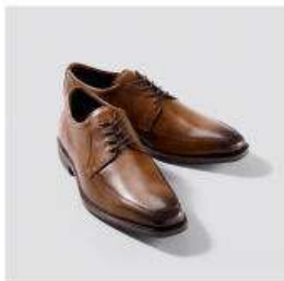
ECCO $119.90 after sale $179.95 Amber leather; more colors. 5655815